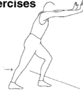
Standing calf stretch