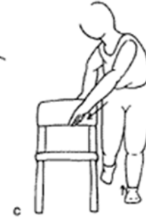
Static and dynamic balance exercises