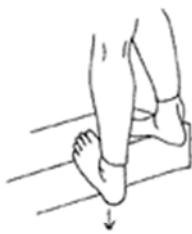
Plantar fascia stretch