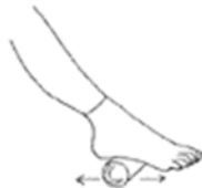
Frozen can roll